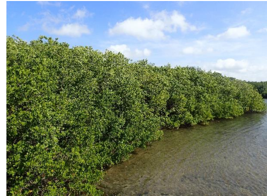
Coastal wetlands (CHIMMP)