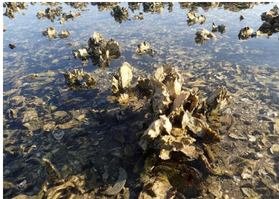
Oyster reefs (OIMMP)