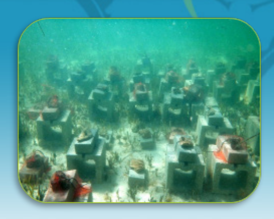
Various sponge propogation methods being tested in a nursery