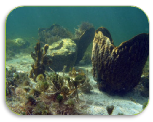
A healthy sponge community in Florida Bay

Consequently, restoring sponge communities by transplanting cuttings of healthy sponges into areas where dieoffs occurred can be an essential tool to jump-start natural sponge recruitment and re-establish vital ecosystem services that sponges provide. Preliminary sponge restoration research showed that cuttings of several sponge species can be successfully transplanted to produce new sponges. Current sponge restoration research will examine whether transplanted sponge cuttings can restore critical ecological functions that are provided by healthy sponge communities.