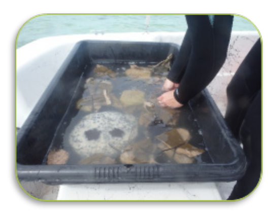
Propogating new sponges using cuttings from a healthy sponge.