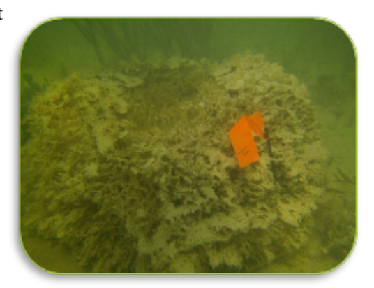
A loggerhead sponge after a die-off