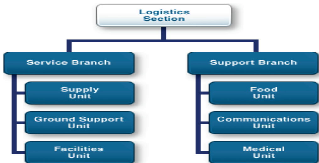
Figure 5-1. The structure of a fully activated Logistics Section.

Six functional units can be established within the Logistics Section. If necessary, a two-branch structure can be used to facilitate span of control. Figure 5-1 is the typical framework of a fully activated Logistics Section. The actual size of the Logistics Section will be based on the needs of the incident.