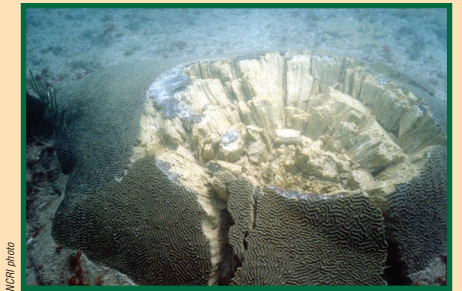
A crushed head of brain coral.

Tropical coral reefs develop only in areas with specific characteristics: a solid structure for the base, transparent water with the right amount of saltiness, warm and stable temperature, and moderate wave action to transport waste from the reef and bring oxygen and microscopic organisms to the reef. There are many pressing threats to the delicate balance that allows coral to thrive.