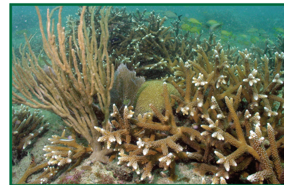
Branching octocoral, seafan, and head coral in a staghorn thicket.

Coral reefs are beautiful, and they provide a marvelous resource for recreation, education, scientific research, and public inspiration . Millions of tourists and local residents enjoy scuba diving, snorkeling, and fishing , thanks to Florida's coral reefs. These activities are a