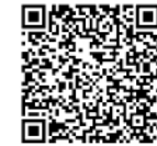
Federal Speed Zones