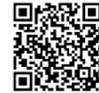
State Speed Zones

Smart phone users can quickly access the Web sites listed above by scanning these QR Codes.