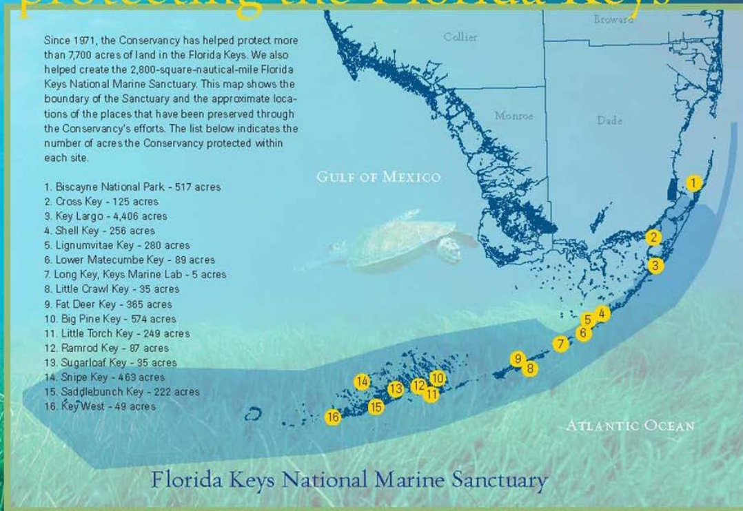
Florida Keys National Marine Sanctuary